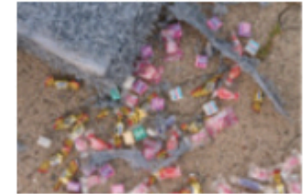
Sita Kuratomi Bhaumik/Courtesy SoEx